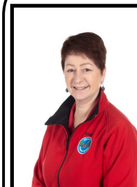
Designated Teacher for Child Protection